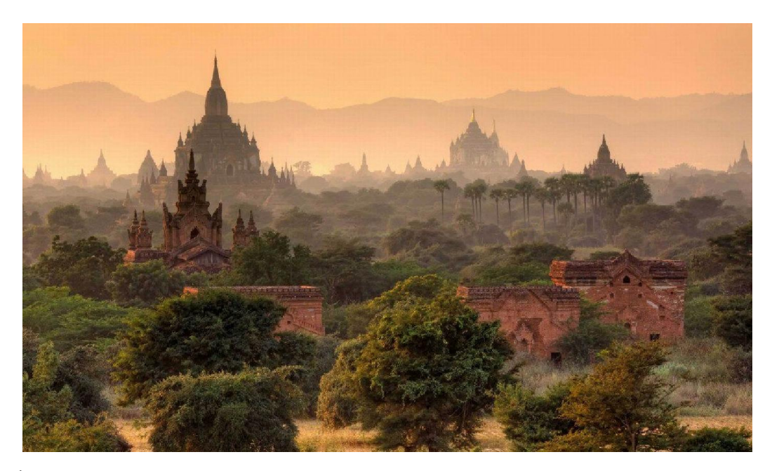
The site at Bagan

No Buddhist country can boast as many pagodas as Myanmar. They are truly magnificent! But this country has more to offer than just pagodas... In Mandalay, Bagan, Yangon, you will get a real sense of the magnitude of the Irrawaddy, one of Asia's greatest rivers, which plays a major role in the life of many Burmese. A trip to Myanmar will not fail to satisfy those in search of magnificent and charming experiences.