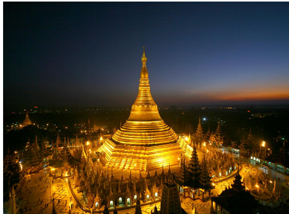
The famous Shwedagon Pagoda

Among all the treasures Myanmar has to offer, the Mergui archipelago is without doubt the least well known. And yet, with its jade-green sea, ivory sands and its special laid-back lifestyle, it is well worth a visit.